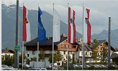
View from the Salzburg Airport Wolfgang Amadeus Mozart to Airporthotel Salzburg